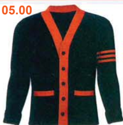
Left Sleeve Stripes