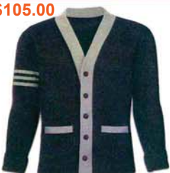
Right Sleeve Stripes

To SEE your sweater design, use the Apparel Builder!