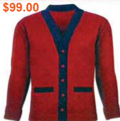
No Sleeve Stripes