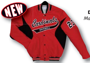
DOW 300 Matching Sleeves page 2