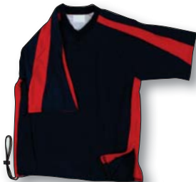
VP 168 Batting practice page 5