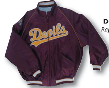
DOW 041 Raglan Sleeves page 3