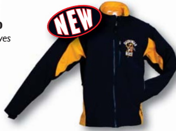
DOW 400 Set-In Sleeves Side Panels page 2