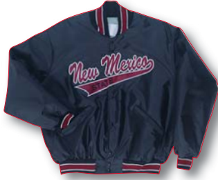
DOW 031 Set-In Sleeves page 3