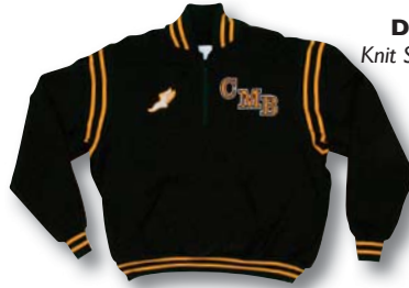
DOW 012 Knit Shoulder Insert page 4