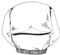
COLLAR NO. 3 - Sailor collar. "Top color" is side showing and "Bottom color" is underneath. Hidden zipper on "Bottom" to form the hood.