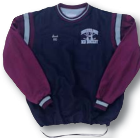
VP 013 Knit Shoulder Insert page 5