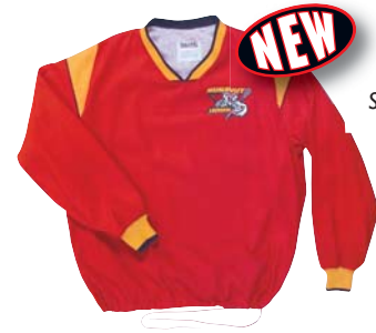
VP 174 Shoulder Insert page 4