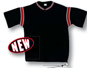
DOW 038 Set-In Sleeves page 5