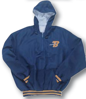
DOW 010 Set-In Sleeves page 4