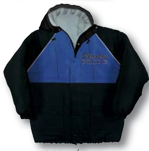
DOW 341 Parka page 6