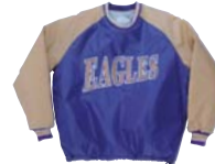
OPEN HEM DRAWCORD