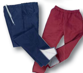
DOWP 20 & 50 Warm-up Pant page 4