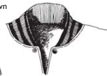
COLLAR NO. 7 - Standard knit. "Stand-up" collar. 100% stretch nylon for color fastness and memory retention.