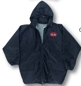
DOW 001 Oversized Sideline page 6