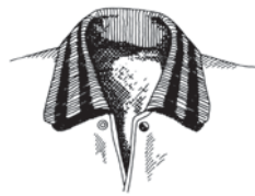
COLLAR NO. 8 - Hug knit or "byron-knit" collar. 100% stretch nylon for memory retention.