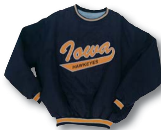
VP 014 Set-In Sleeves page 5