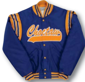
DOW 033 Knit Shoulder Insert page 3