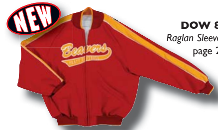
DOW 841 Raglan Sleeve Insert page 2