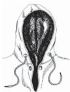
COLLAR H - Hood.