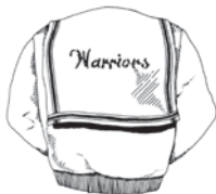
COLLAR NO. 1 - Sailor collar. "Top color" is side showing and "Bottom color" is underneath. No zipper.