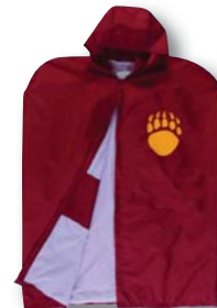
DOW 43283 Sideline Cape page 6